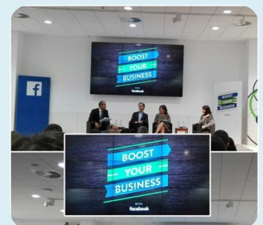
SISTRADE at AICEP Conference - Boost Your Business with Facebook