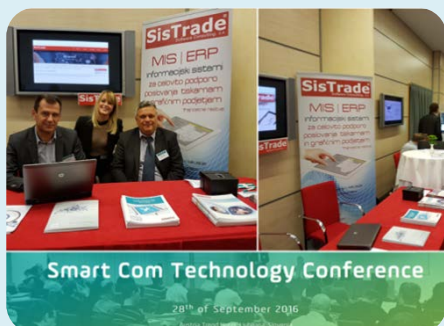
SMART COM Technology Conference