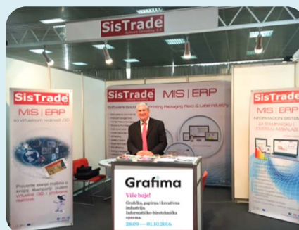
SISTRADE at GRAFIMA 2016 fair in Serbia